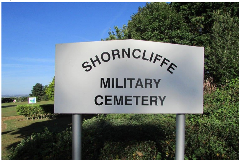
Shorncliffe Military Cemetery, Folkestone