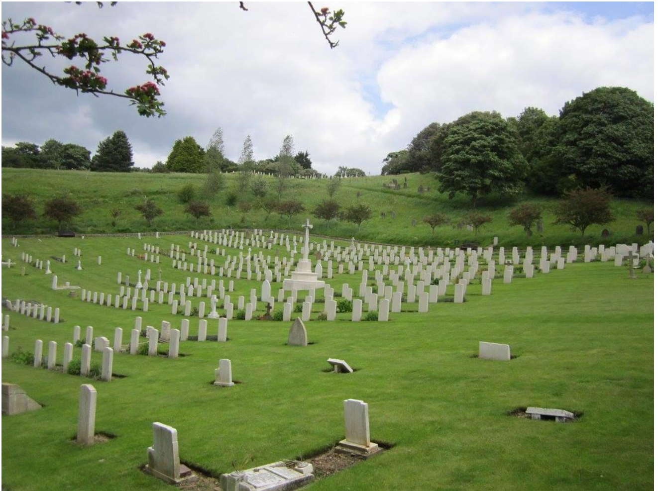
Shorncliffe Military Cemetery, Folkestone