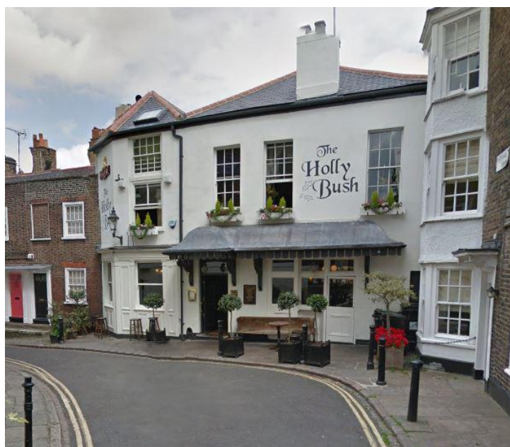
Holly Bush Hotel